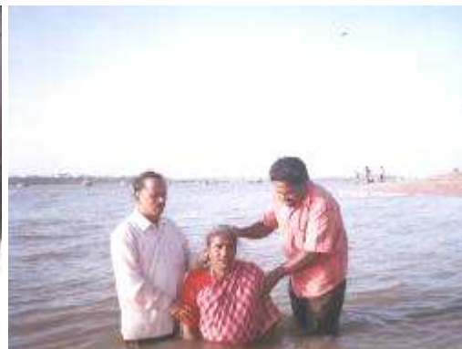
Eunuch being baptized