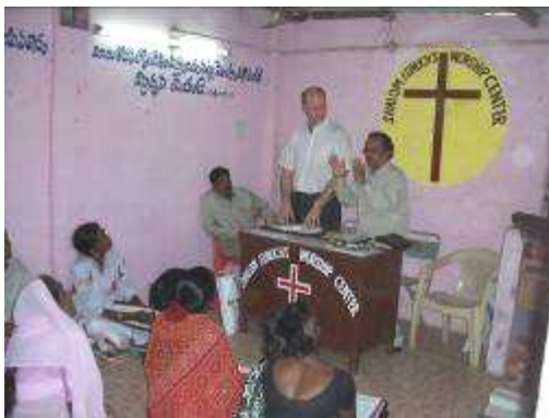
Eunuch Church in Mumbai